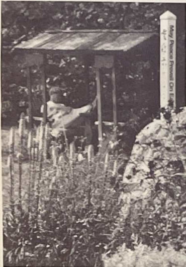
The serenity and beauty of the woods and facilities are matched only by the spirits of the people who are there. -PN. NYC