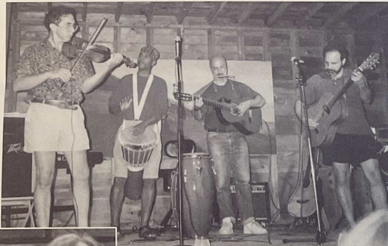
The Boys of Bedlam will add to the festivities of the Annual Labor Day Weekend Music Festival.