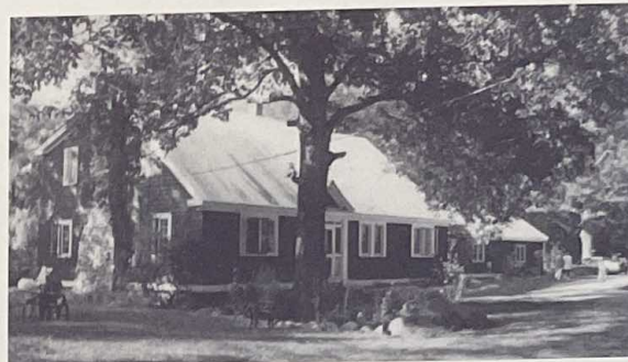
The Uphaus Lodge features 9 of our best rooms and is named after former directors, Willard and Ola Uphaus.