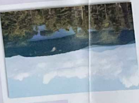
Graphic Design: www.jaymelnic.com