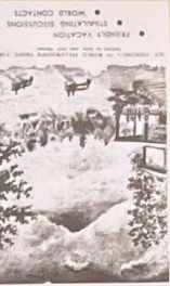
• TRAVEL VACATION • FINANCIAL DECISIONS • WORLD CONTACTS

NEW HAMPSHIRE World Fellowship CENTER SUMMER 2008